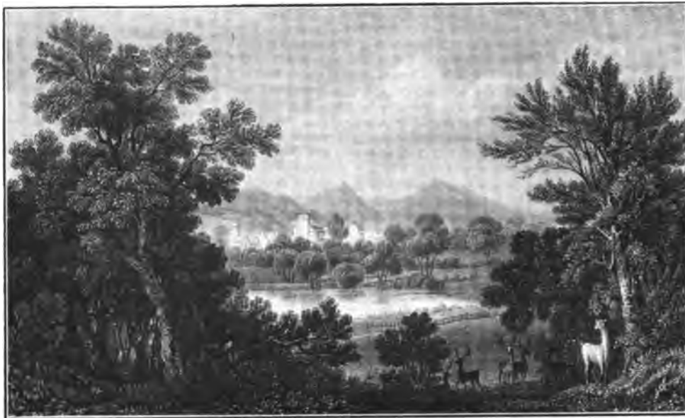
WELSH POOL VILLAGE